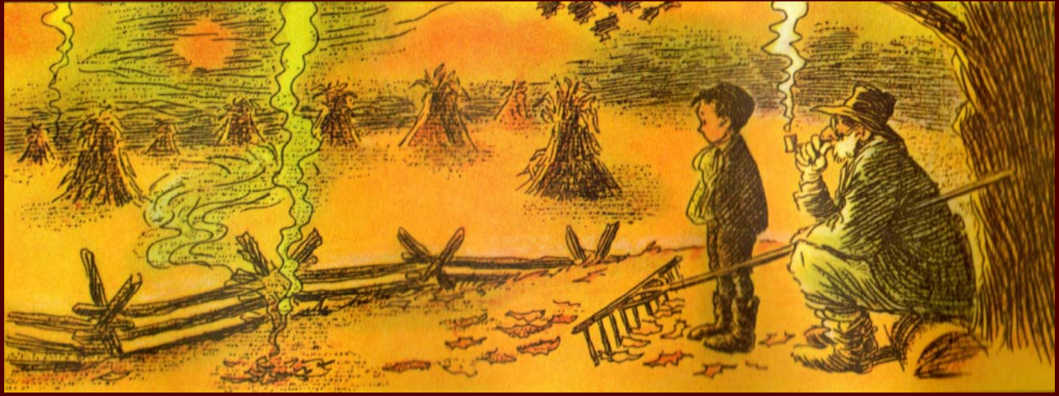
INJUN SUMMER BY JOHN T. McCUTCHEON

The Wheeling Historical Society and Museum celebrates the link between the past and the present. The museum is a cooperative effort of the Village of Wheeling, Wheeling Park District, Indian Trails Public Library.