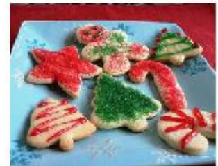
Baked Home Made Cookies