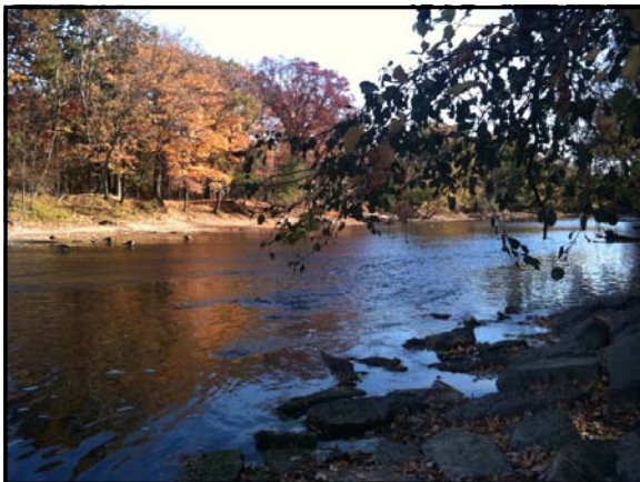
Des Plaines River at Dam No. 1 October 2010