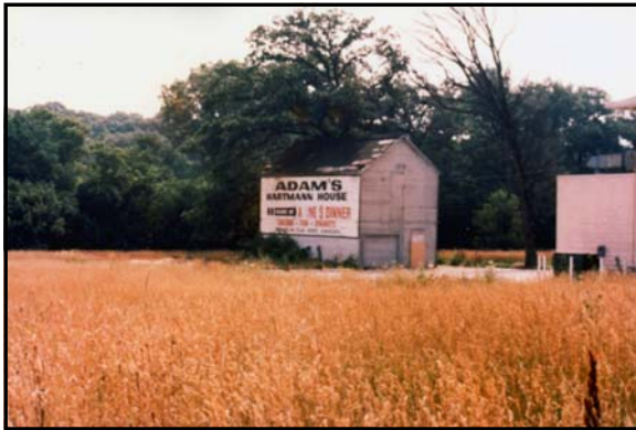
The ice house on the Des Plaines River ca. 1982

Remember the wood-smoky, smoldering scent of raked, burning leaves? The sweet and spicy scents of autumn candles and potpourri. The sight of children running door-to-door in the twilight, wearing homemade costumes,