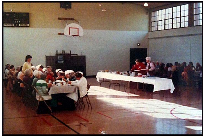
A Senior Party at Heritage Park