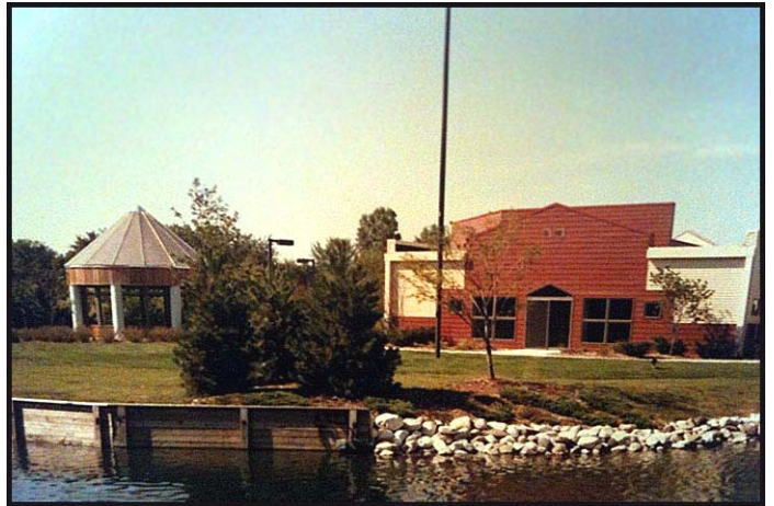
New Construction of the Pavilion and Gazebo

If all the people who fall asleep in church were laid end to end, they’d probably all rest much better. ☺