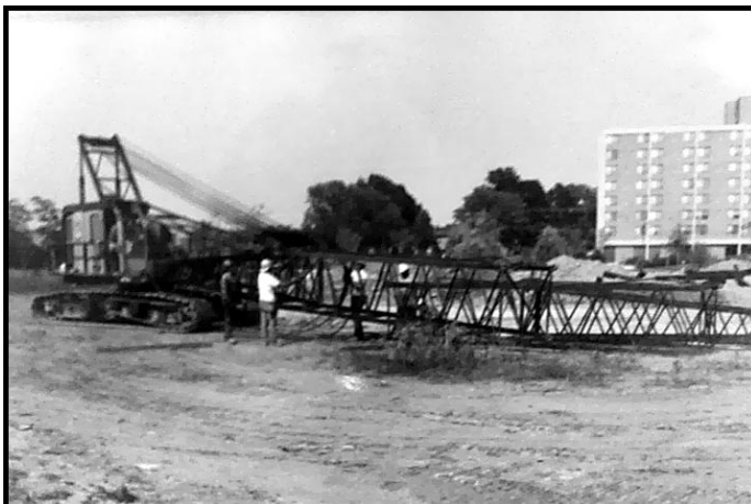
The Construction Begins