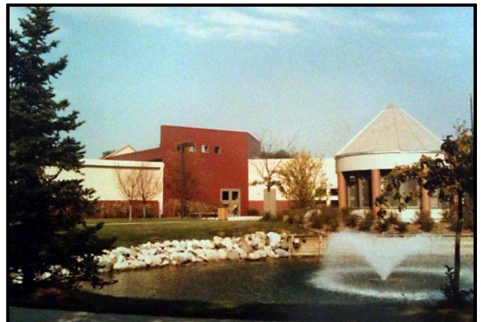
The Pavilion and Gazebo

"The object of this Society shall be the discovery, preservation, and dissemination of knowledge about the Community of Wheeling."