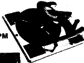
78 RPM Records