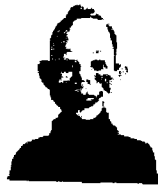
Peashooters. Howdy Dowdy.