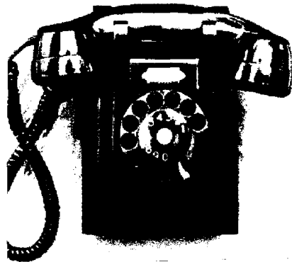
Telephone numbers with a word prefix..(Raymond 4-601). Party lines.