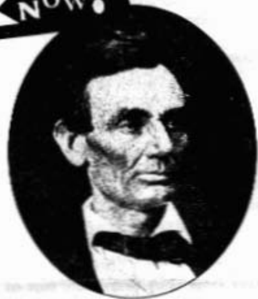
ABRAHAM LINCOLN 1809-1865

Abraham Lincoln was America's sixteenth President. His career as a statesman is well known. Little known is that he was a great lover of poetry. His speeches and writings are filled with great and beautiful prose, but he only wrote three poems.