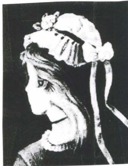
OLD WOMAN...OR YOUNG GIRL?

Hang On Sloopy is the official rock song Of Ohio.